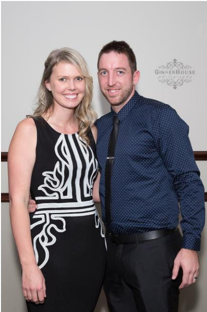
Above: Some of our Netballers looking very glamorous on the night.