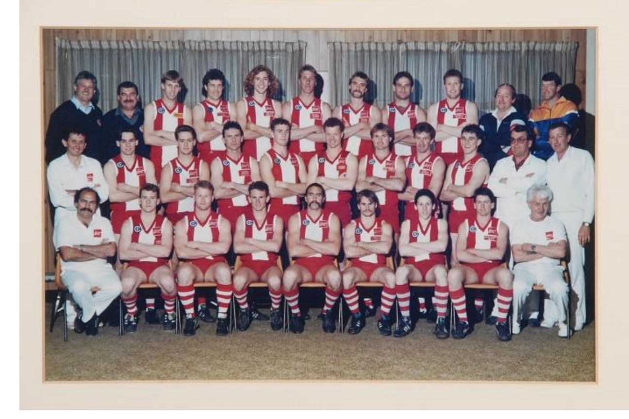
UNDER 18 - PREMIERS