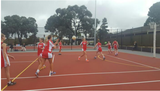
The B Reserve side warming up before their Round 5 Match against Kyneton