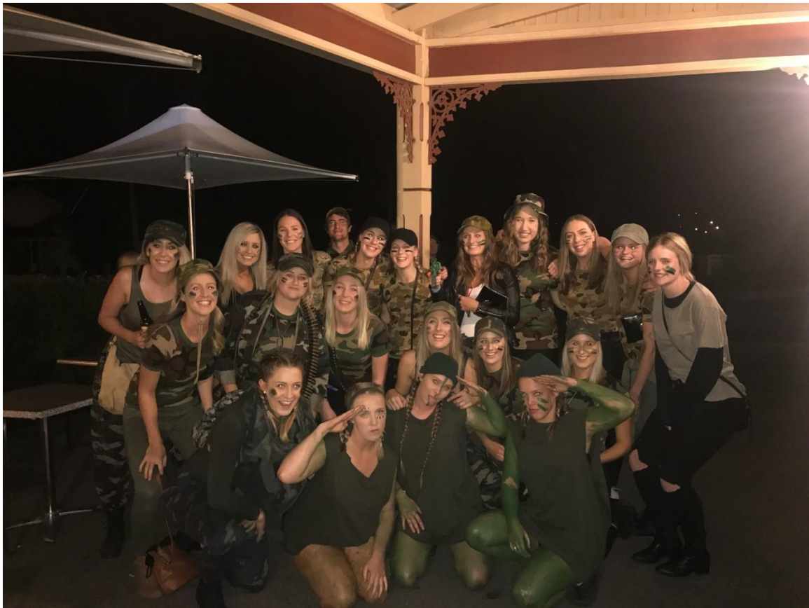
Some of our Netballers outside our good Sponsors the Old Bpoundary Hotel prior to the players army themed post match function.