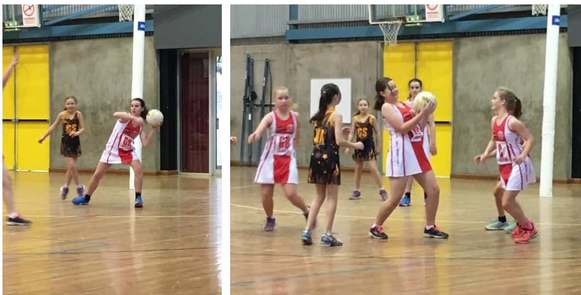
Primary Section Grade 6 Green Team