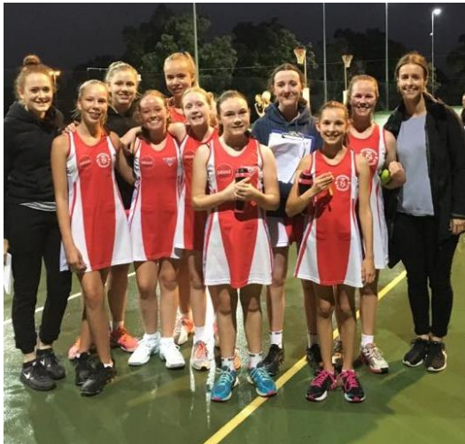
Open Section 4 Blue Team

As well as the Grade 5 Primary team, we also have teams in the Grade 6 Primary Section (one team), the 13/U Section (two teams) and the Open Section (four teams).