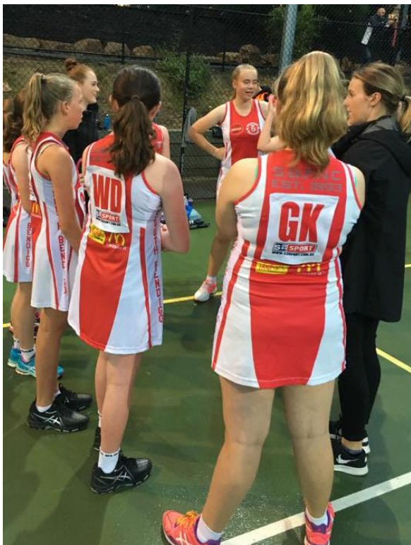
Some action shots from our Open Section 4 Blue Team (left) and our 13/U White Team (below)

The Club held a start of season get together at the Bendigo Stadium on Thursday 4 th May. This was a great opportunity for all of our teams to come together in the one place and more than 50 people enjoyed a night out meeting and mixing with other families.