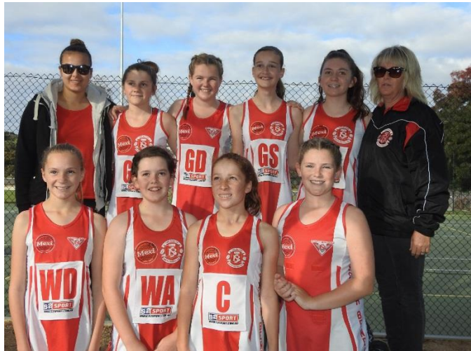
Section 13/U White Team