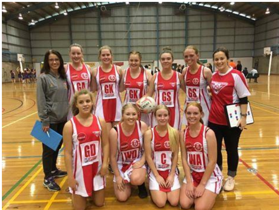
Open Section 3A Gold Team