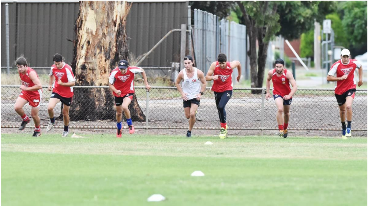
Pre-Season effort at Harry Trott; building a foundation for success

South Bendigo opens the 2017 BFNL season against Eaglehawk at the QEO on Good Friday.