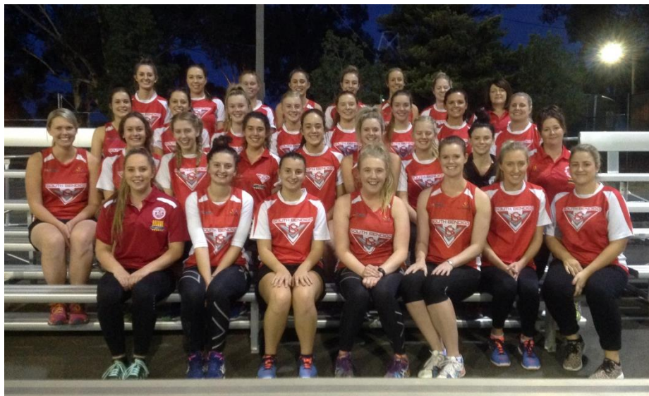
2016 Netball Squad Mixture of A Grade, A Reserve, B Grade, B Reserve & Under 17's