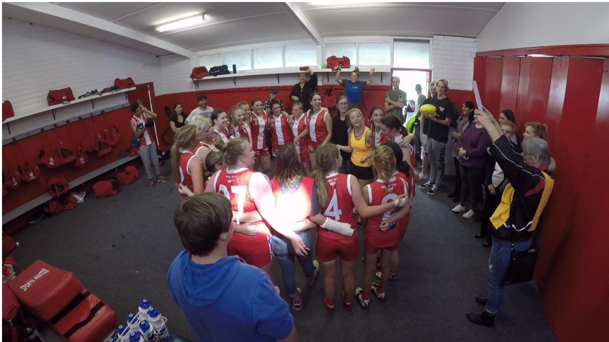
The Youth Girls Team singing the Club song after beating North Bendigo in the opening round