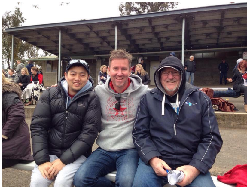
View from the Hill with two local supporters