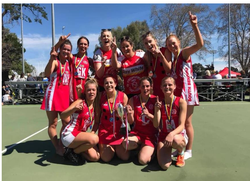
South Bendigo 2018 B Reserve Premiership Team