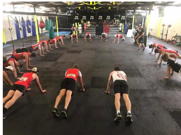
Pictured above an indoor session at Tribe Boxing - Yoga