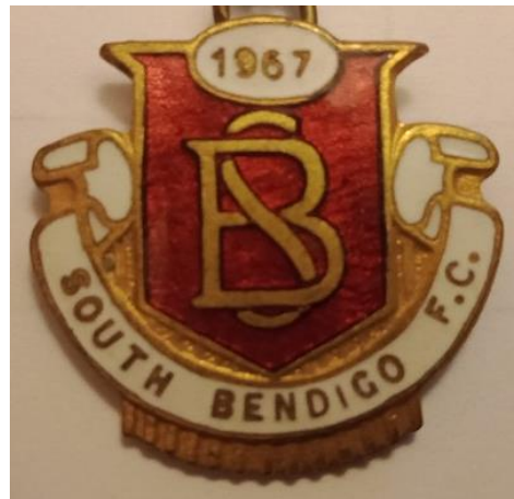
Fig 2: The basis of the current logo became consolidated as the emblem of the club in the 1950's

In 1991 the Bendigo Football League introduced a netball competition. The club formed a netball division that year and in 1999 the club became known as the South Bendigo Football Netball Club. The club's emblem was changed slightly at that time, with the wording in the scroll being amended from SOUTH BENDIGO FC to FOOTBALL & NETBALL CLUB