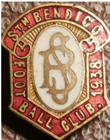
Fig1: The symbol of the interwoven SB letters became a common component of our emblem in the 1930's

*All of these years/dates are best "guesstimates" based on those past membership medallions still in the Club's possession.