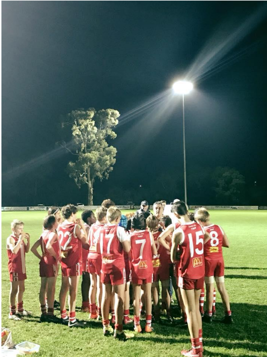
Our Under 14's playing under lights at Harry Trott Oval