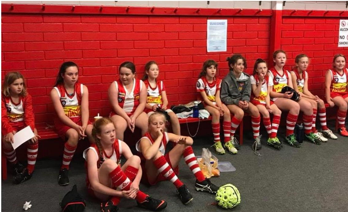
The Under 12 Girls following a match at Harry Trott oval