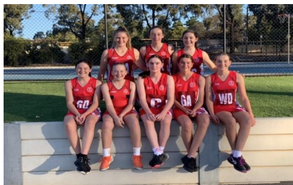
Section 3 Arnold