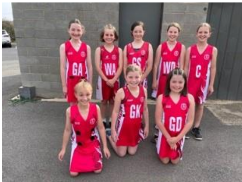
Section 4 Chapman