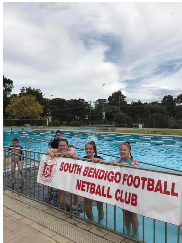
Flying the Flag: The Junior Division's Family/Registration Day at Brennan Park Pool

The U16 and U14 age groups have already started Pre- Season training with the remainder of the junior division to get started over the next few weeks. Bring on the footy!