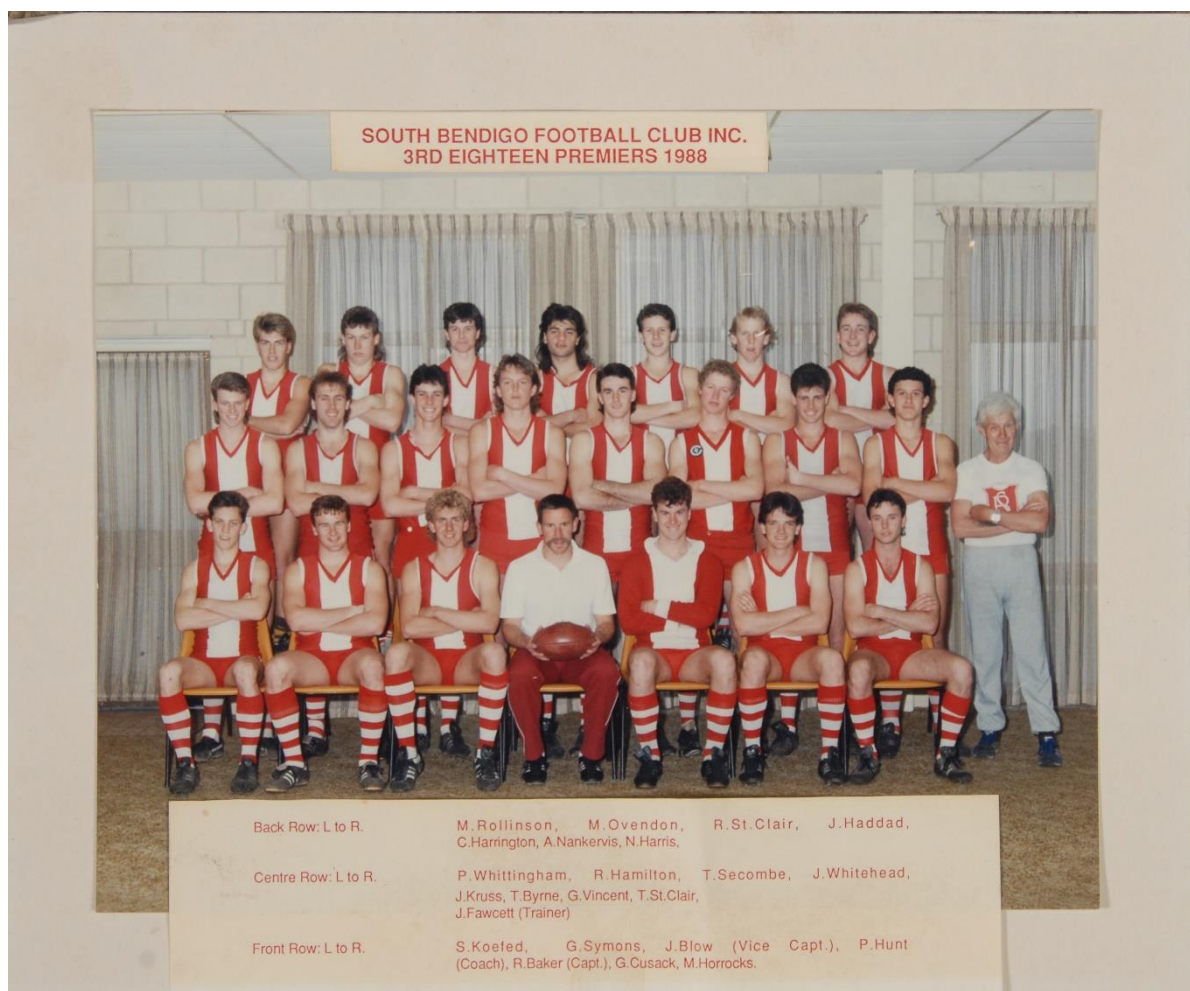
Pictured: SOUTH BENDIGO 1988 U18's Premiers Bendigo Football League.