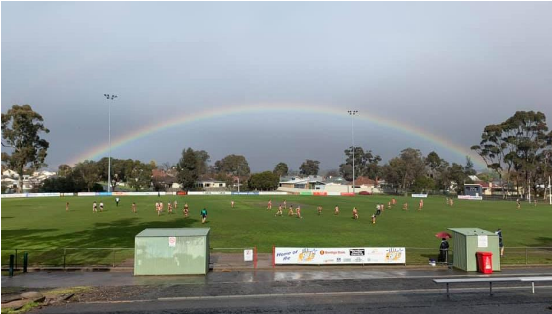
Morning rainbow over Harry Trott for our U13 girls on Sunday 11 th August.