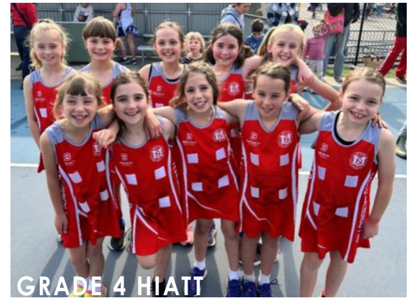
GRADE 4 HIATT