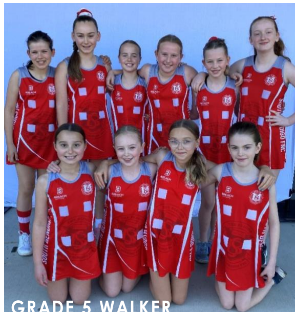
GRADE 5 WALKER