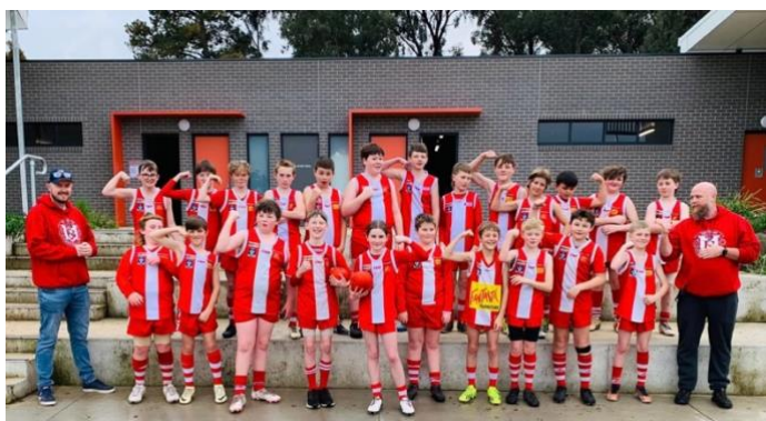
Our victorious Under 12D (2) team

Stay tuned to our social pages for the latest updates on games and results.