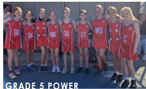
GRADE 5 POWER