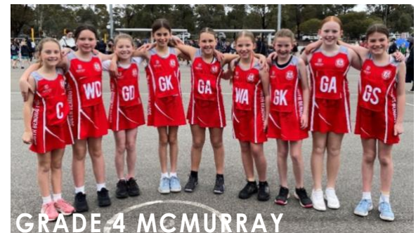
GRADE 4 MCMURRAY